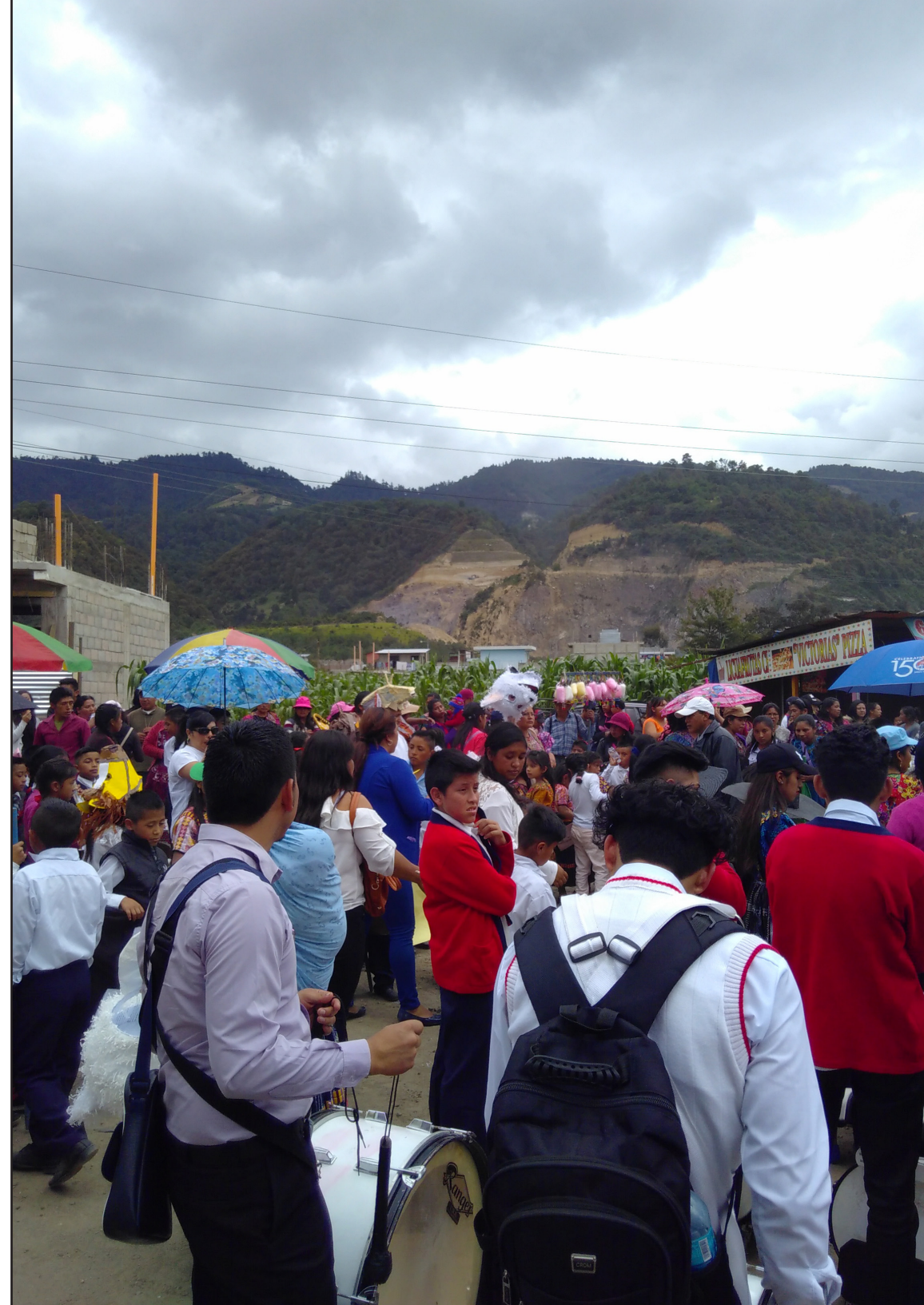
Cantón Xecaracoj, Quetzaltenango, Guatemala